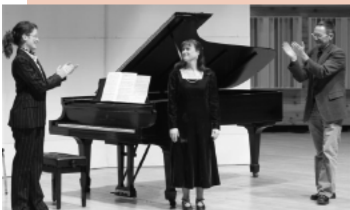
Osvaldo Golijov with student musicians

During his talk, Golijov described his musical vision and the various influences on his work. Originally from Argentina, the composer lived in Jerusalem for several years. He referred to the strong influence of Jewish life in those places and of synagogue liturgy on his music. He also shared insights into his creative process. The evening culminated with performances by student musicians of