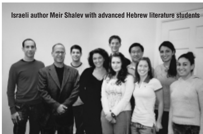
Israeli author Meir Shalev with advanced Hebrew literature students