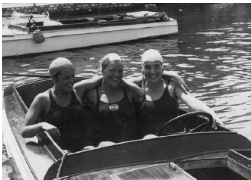
Films featured at the 2005 Festival: Watermarks (above) and Sister Rose's Passion (below)